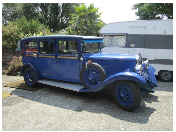
1931 Austin Ranelagh Limo, a lovely Big Austin