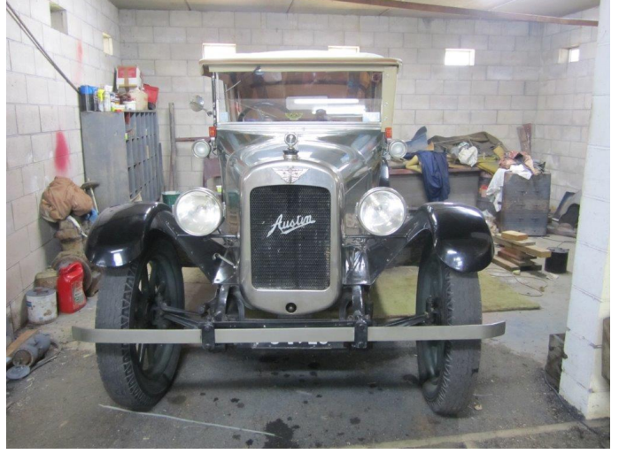
1928 Austin Tourer tucked away in a side shed.