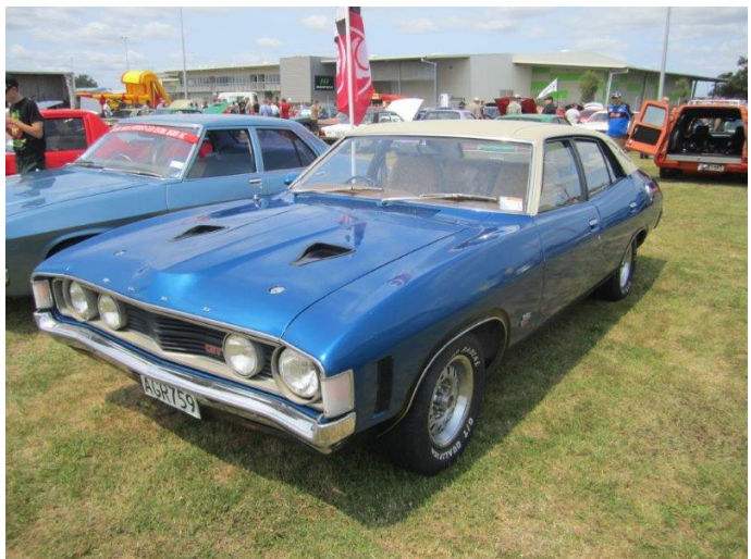
A 1973 Ford XA GT 351 from Masterton.

Also in stock on the day were a 1928 Tourer, a 1924 12/4 Roadster, a tempting vehicle, an A55 sedan and tucked away inside a very desirable Austin 8 sports (convertible)