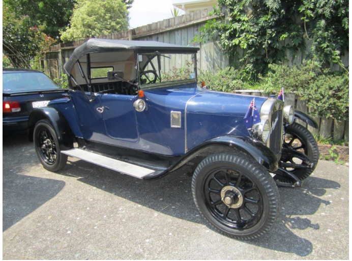
Pretty 1924 Austin 12/4 Roadster.