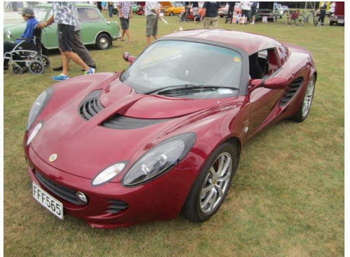
2005 Lotus Elise