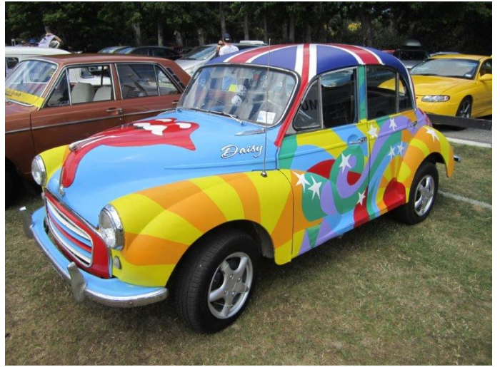
Daisy, a 1960 Morris Minor with a distinctive paint job and Nissan motor. Another Masterton car. You should see his Morris Ute.