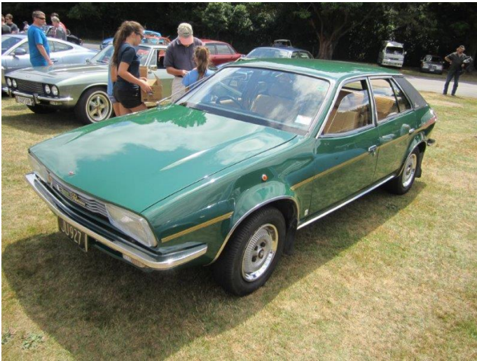
One of two owned by the driver of this green 1980 Austin Princess. A Masterton car