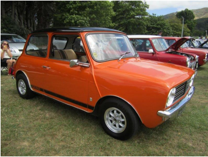
All the Mini Clubs and many owners have strongly supported British Car day since the beginning. A nice orange Clubman just one of many for 2015.