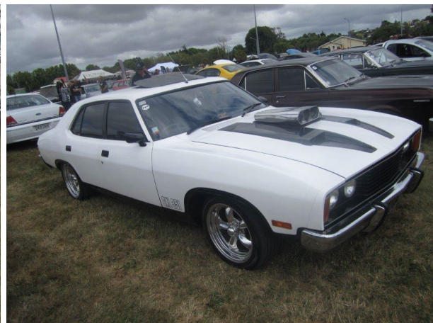
Ford Fairmont 351 1977.

As always it was a great day with many of our regular mates in attendance, the flag flying really high again and the banner also alerting people to where were.