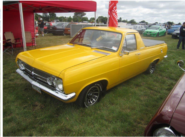
Holden HR Ute 1967