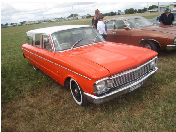
Ford Falcon SW 1966..