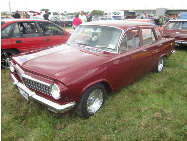
Two other older Holdens looking good. Holden EH 1964