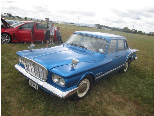
Chrysler Valiant 1962.