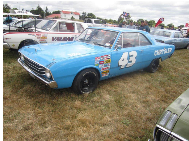
Valiant race car 1970 hard top.