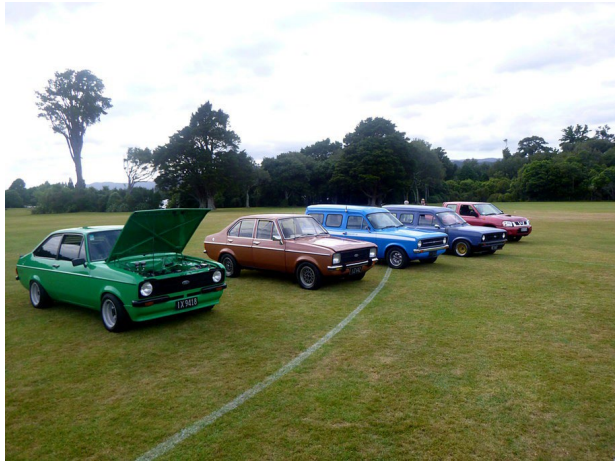
Escort 2 door, 4 door and 2 x Vans.