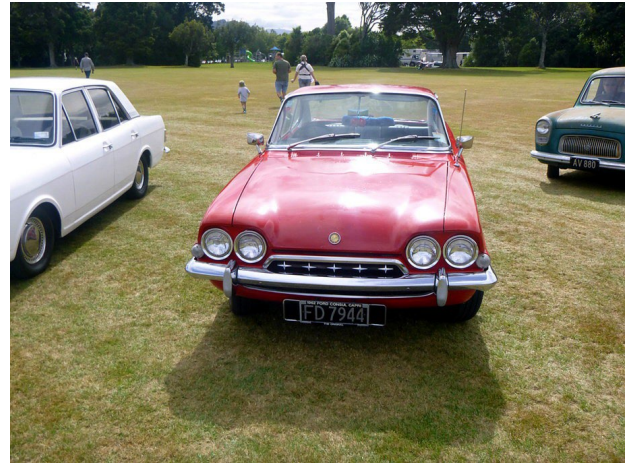
Consul Capri (a local 1962 model)