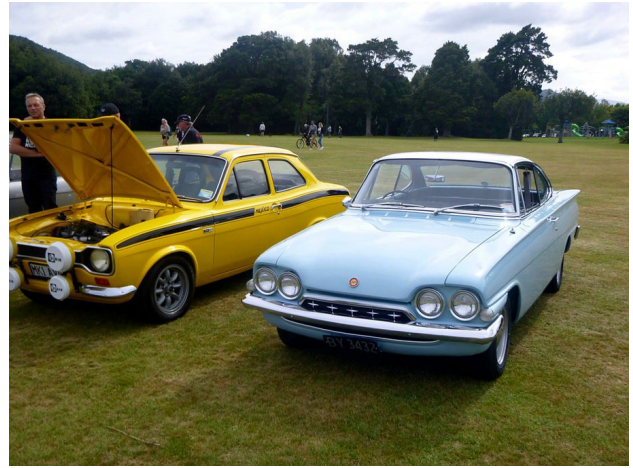
MK1 Mexico and Consul Capri