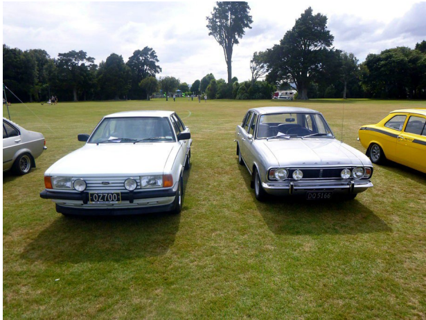
MK 4 and Mk 2 Cortina sedans.