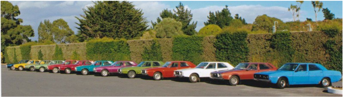
(National Rally Weekend 2013. A good line up of Leylands taken in Southwards car park. This shows 13 cars wearing 12 different colours, 11 of them factory including two in AG and 1 in ON, B as B, P, Dr, Cb, PMAG, SO, BA, CW, PS (GMH) and AEB)